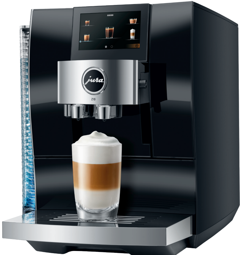
15423 JURA Z10 black