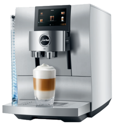
15360 JURA Z10 alu

Z10 with P.R.G. for hot and cold brew speciality coffees