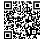
JURA Z10 alu

JURA SEA (Pte.) Ltd. 25 International Business Park, German Centre #01-01/10, Singapore 609916 Tel.: +65 65628853, Fax: +65 65628854, Email: info@jura-sea.com, Web: https://www.jura-sea.com