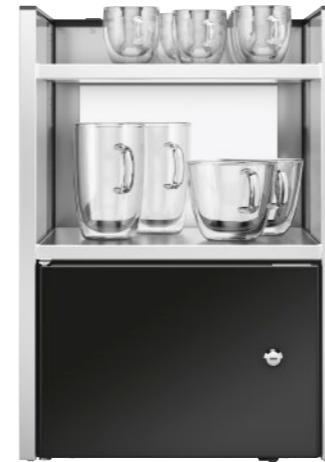
CUP & COOL, WIDE

ONE UNIT, TWO FUNCTIONS: WARMING AND COOLING