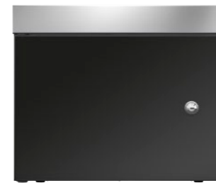
COUNTERTOP COOLER (LARGE)

This model boasts a removable milk tank and offers the option of sensors for milk temperature and a milk empty message.