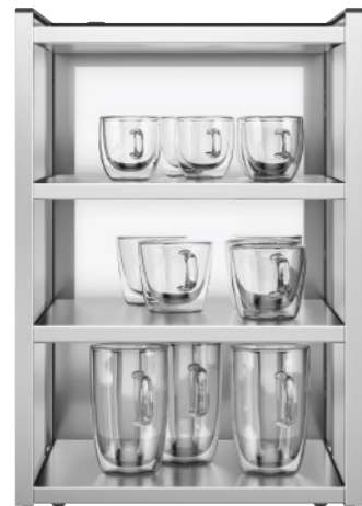
CUP RACK, WIDE

PERFECTLY WARMED CUPS, STYLISHLY DISPLAYED