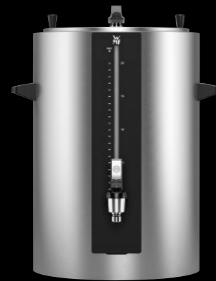
HEATED THERMAL CONTAINER (20L)