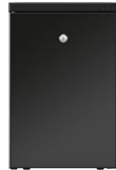
COUNTERTOP COOLER (MEDIUM)

Available either with or without a large digital display on the front panel, the two variants of WMF's small Countertop Cooler both have a removable milk tank with a 3.5-litre capacity, and each is fitted with a thermostat and separate on/off switches. Suitable for self-service venues, they are lockable with a removable seal.