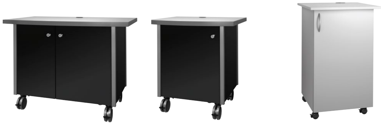
MOBILE COFFEE STATION 125+ / 85+

DELIVERING COFFEE INDULGENCE, IN TOTAL AUTONOMY