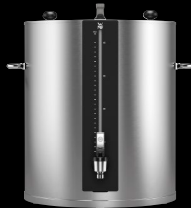
HEATED THERMAL CONTAINER (40L)

CONSISTENT TEMPERATURE FOR CONSISTENT TASTE