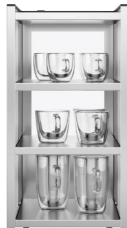
CUP RACK, NARROW

Made with high-quality, easily cleanable stainless steel and shatterproof glass, WMF cup racks are designed to be positioned directly next to the coffee machine. So your cups will always be close at hand, and just the right temperature. Transparent side panels make for easy inspection, and coloured LED lighting can be adjusted to suit your venue.