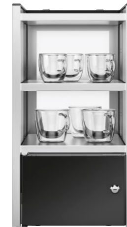
CUP & COOL, NARROW

Contained within the same footprint as a standard cup warming rack, WMF Cup&Cool units combine both cup warming and milk cooling functions. For maximum hygiene, the milk tank is removable, easy to clean and easy to fill, while the optional milk volume sensor lets you know when to refill. The lockable door is ideal for self-service venues.