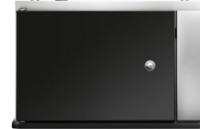
UNDER-MACHINE COOLER (WMF 9000 S+)

The large capacity of this Countertop Cooler makes it suitable for use with either one or two WMF coffee machines, with milk hose routing on both the left and right sides. Milk temperature and milk empty sensors are available as an option.