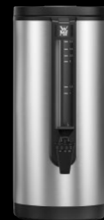
THERMAL CONTAINER (2.4L)

The range of thermal containers for use with the WMF 9000 F includes an insulated pot with a 40-litre capacity and a 20-litre model, as well as a 2.4-litre model which can be filled from the pot brewing arm, and is also suitable for use with the WMF 9000 F (Internal Storage).