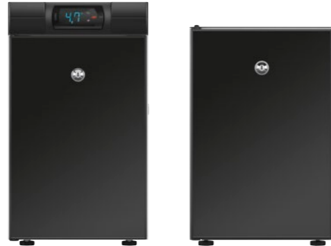
COUNTERTOP COOLER (SMALL)

Designed to be placed between two WMF coffee machines or next to a single machine, this Countertop Cooler features a removable 10.5-litre milk tank and a digital display showing the milk temperature.